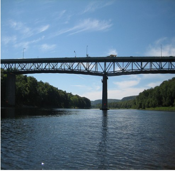
An additional five feet of depth would give the Delaware the capacity for larger cargo ships to come through the ports

NJ SEED Thanks Our 2010 Annual Sponsors!